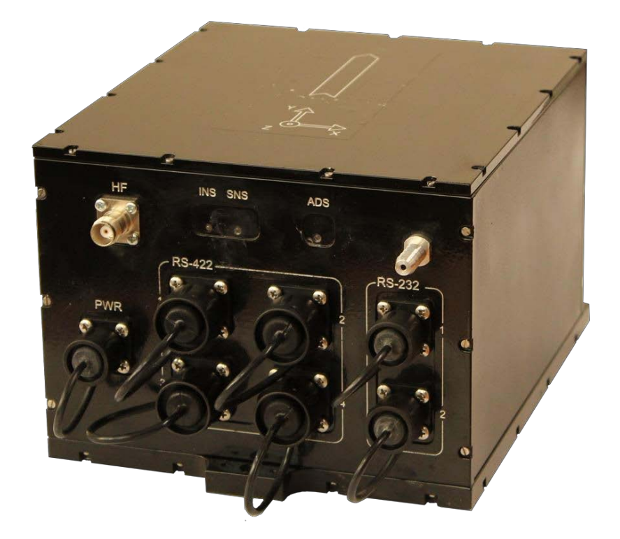
Figure 1. Nav-5L navigation system